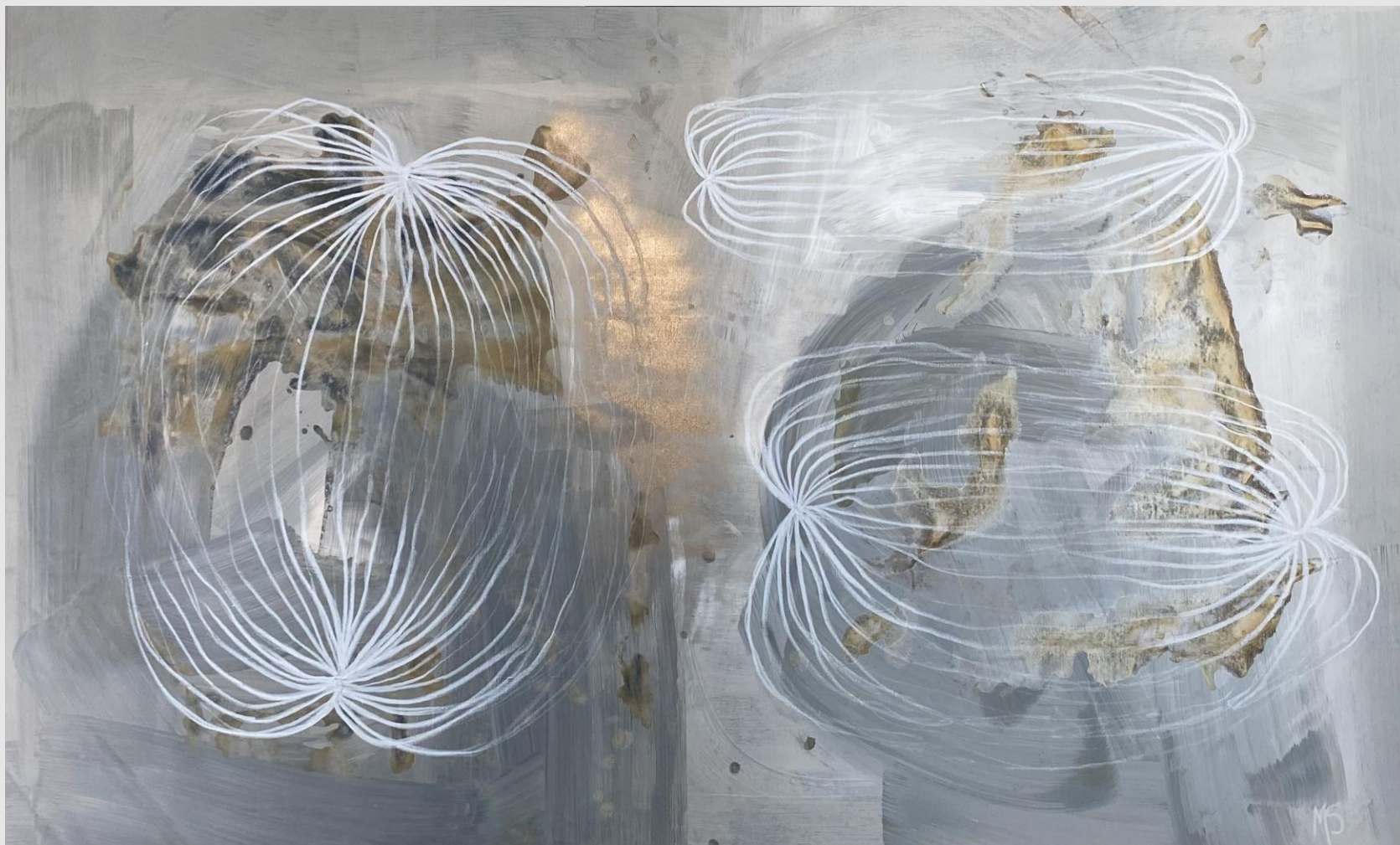
Paint on canvas | Acrylic and pigments | “Linkage” | 47 x 80 “ | 2022 | US3.900 . EEUU