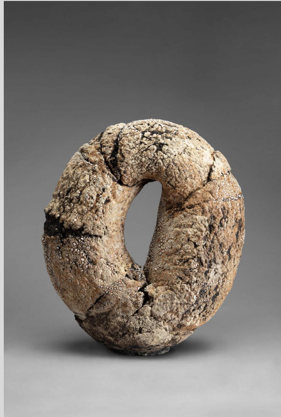
Stoneware reduction burn 1.300° | “Cycle IV” | 17,7 x 13,7 x 6,6” | 2020 | US2.900