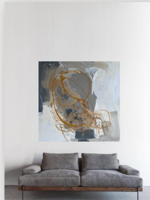
Paint on canvas | Acrylic and pigments | “Connection III” | 60 x 60” | 2022 | US$3.900. EEUU