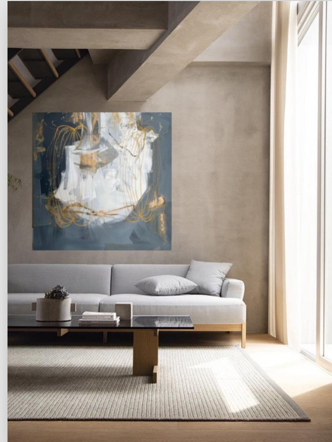
Paint on canvas | Acrylic and pigments | “Rooting II” | 56 x 56” | 2022 | US3.700. EEUU