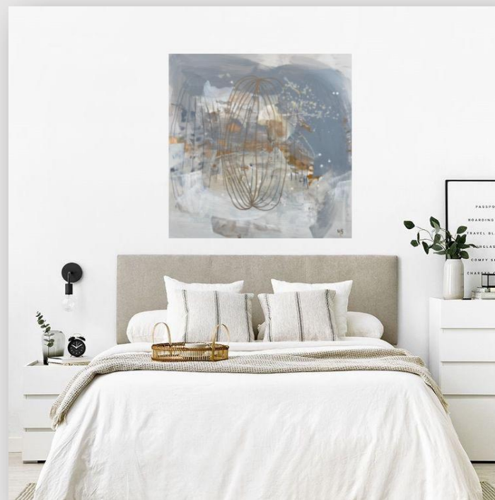
Paint on canvas | Acrylic and pigments | “Link” | 52 x 52 “ | 2022 | US$3.500 . EEUU