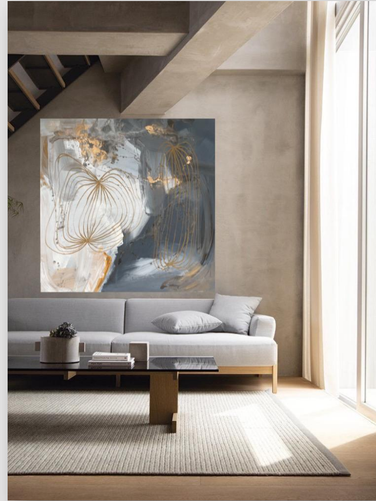
Paint on canvas | Acrylic and pigments | “Rooting III” | 56 x 56” | 2022 | US3.700. EEUU