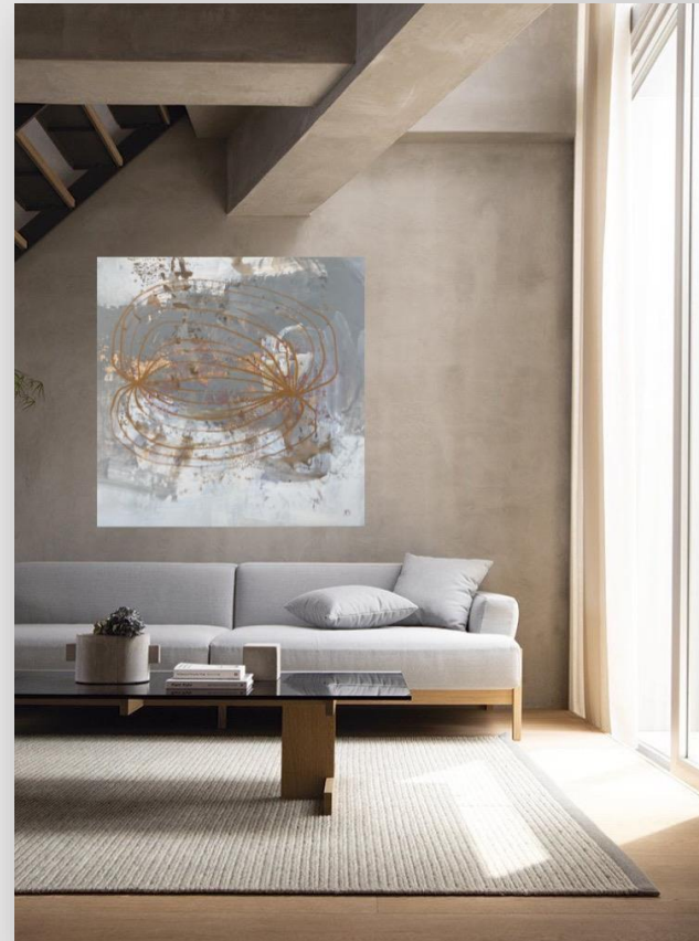
Paint on canvas | Acrylic and pigments | “Surround” | 52 x 52 “ | 2022 | US3.500 . EEUU