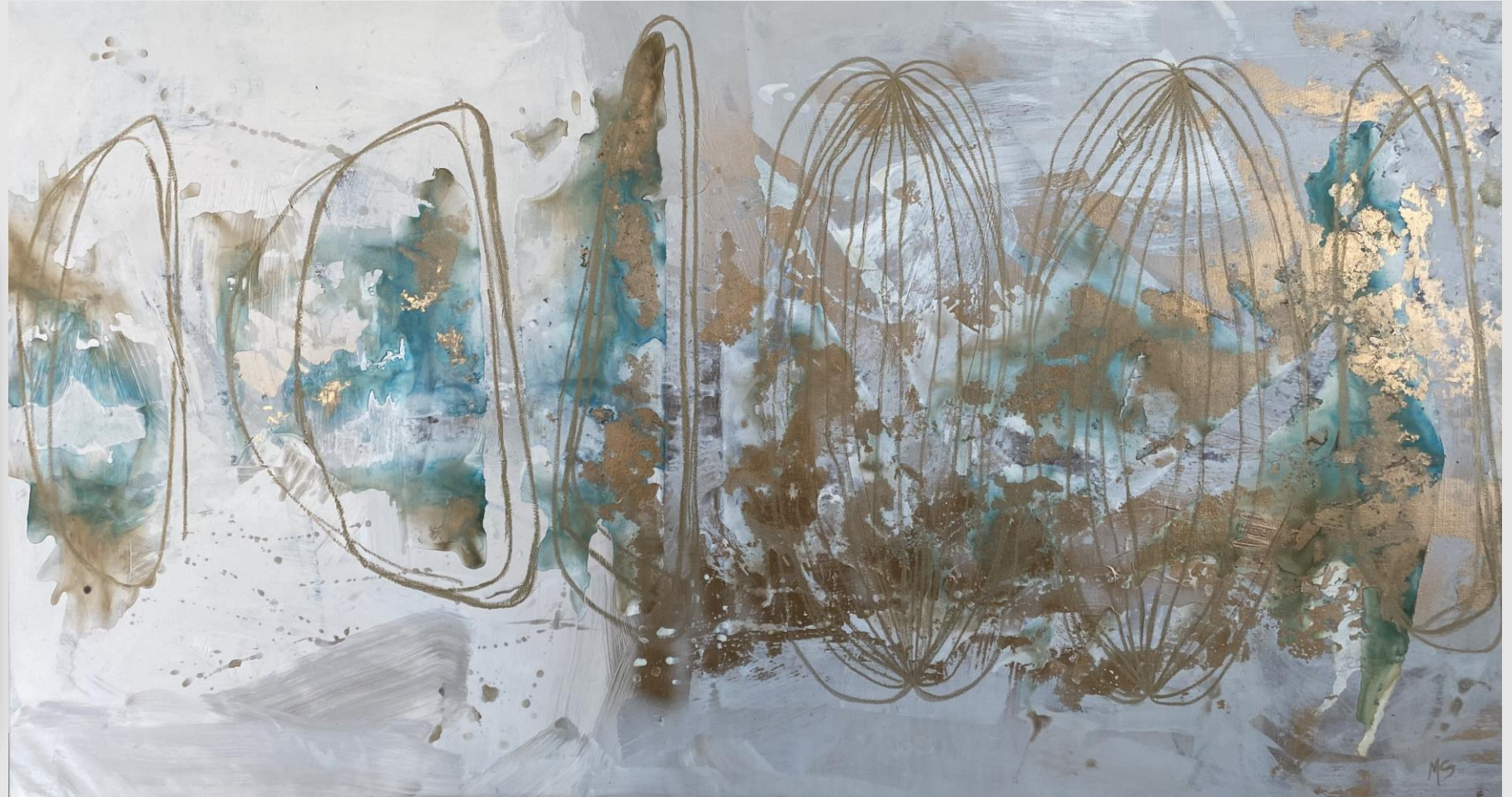
Paint on canvas | Acrylic and pigments | "Territory" | 50 x 90 " | 2022 | US4.500.