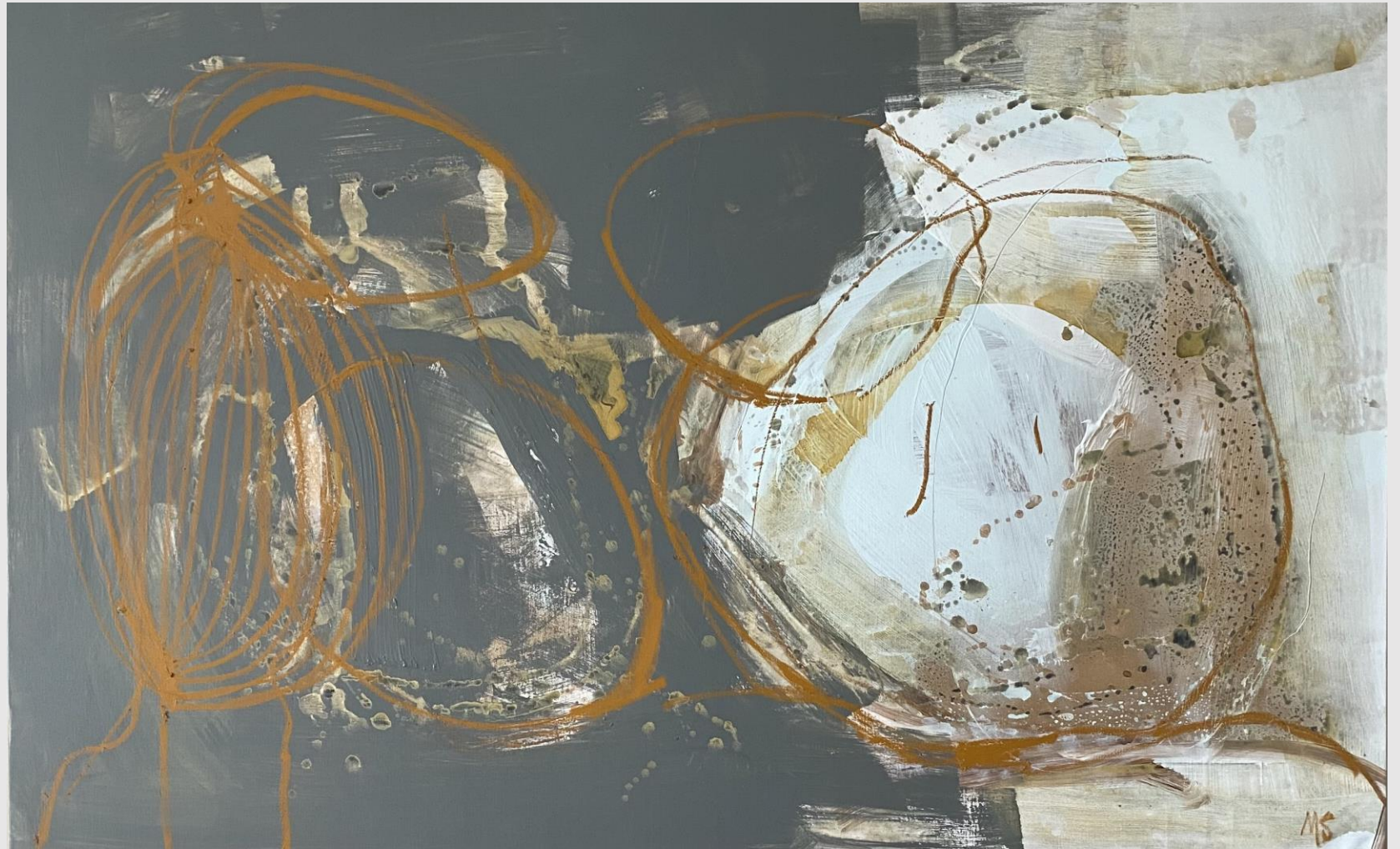
Paint on canvas | Acrylic and pigments | "Belong" | 47 x 76" | 2022 | US3.900. EEUU