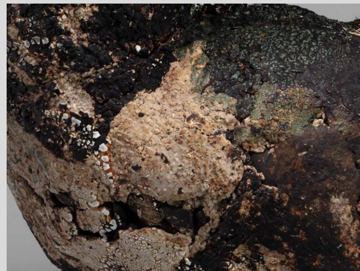
Stoneware reduction burn 1.300° | "Cycles of matter" | 17,7 x 14,1 x 7,08" | 2021 | US2.900.-