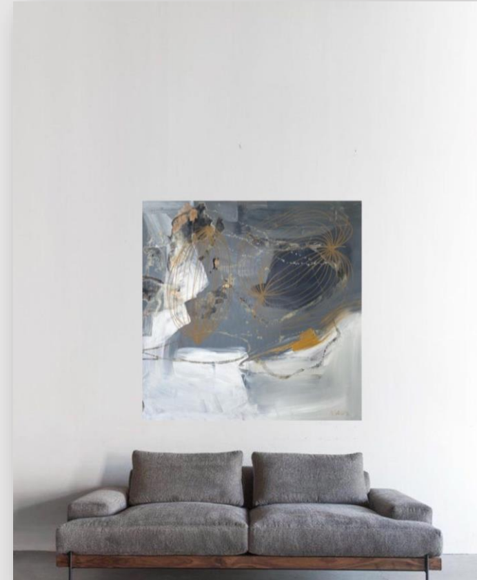
Paint on canvas | Acrylic and pigments | "Rooting I" | 56 x 56" | 2022 | US$3.700. EEUU